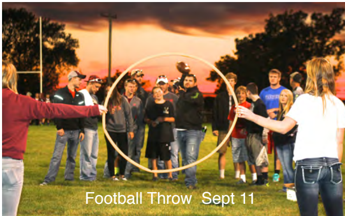
Football Throw Sept 11